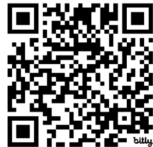
QR Code for GoFundMe