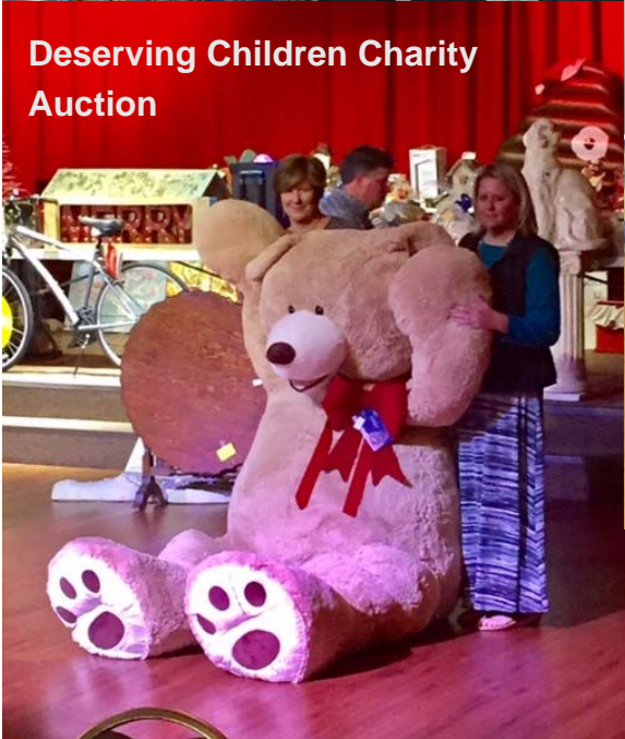
Deserving Children Charity Auction