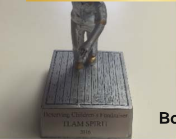
Deserving Children Team Spirit Award Good job, MTM Realty!