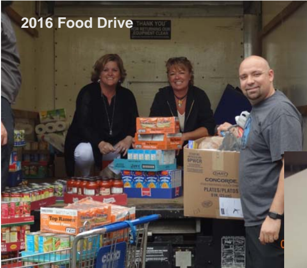
2016 Food Drive