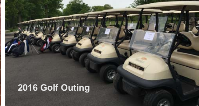
2016 Golf Outing