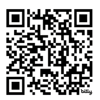
Scan code to donate online

Donations are being accepted through May 2024! Please make all checks payable to "La Porte County Association of REALTORS." You may use our GoFundMe page too... (Please note the following if using GoFundMe link: It will ask a donor for a "tip" to offset costs. You may elect to bypass the tip by entering "0" as the percentage amount. This is an optional feature added by GoFundMe but not required).